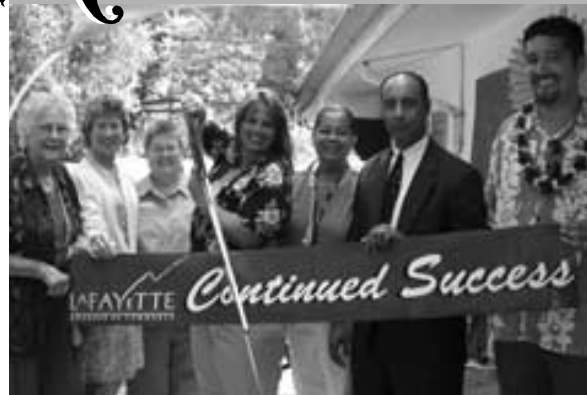
Woodland Hills Nursing Inn staff & Ambassadors celebrate loving care