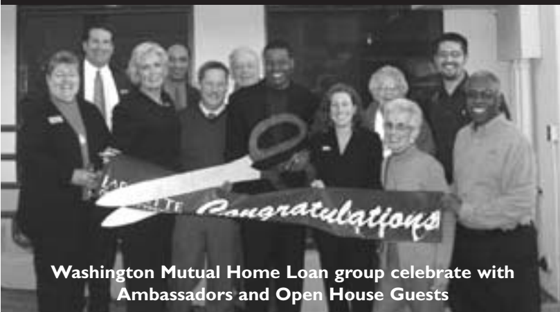
Washington Mutual Home Loan group celebrate with Ambassadors and Open House Guests