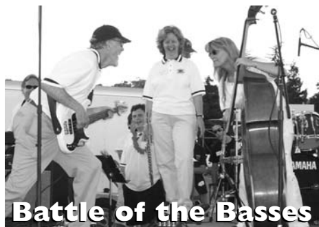
Battle of the Bases