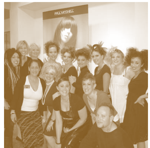
Staff from Paul Mitchell the School at the joint mixer at the Pleasant Hill school

A big thank you to Lafayette Chamber members who donated raffle prizes – HMR Associates, Lafayette Car Wash, Planning for Life, Friends of the Chamber, Warren E. Boschin Bookkeeping & Payroll and Martinez Opera Contra Costa.