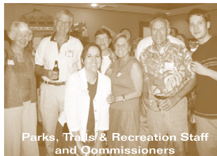
Parks, Trails & Recreation Staff and Commissioners